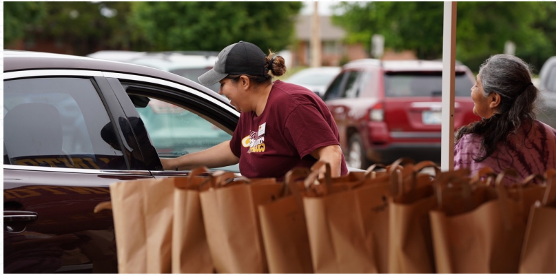
Handing Out Take Home Meals