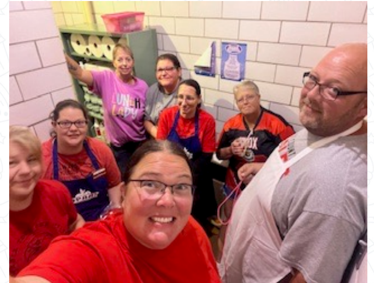
Quality Time in bathroom for a drill!