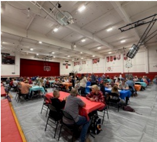
Grandparents Day Breakfast