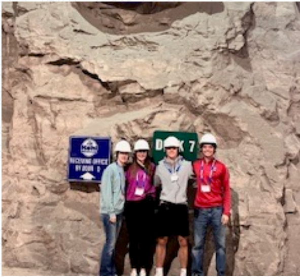
Kohls Cave Tour