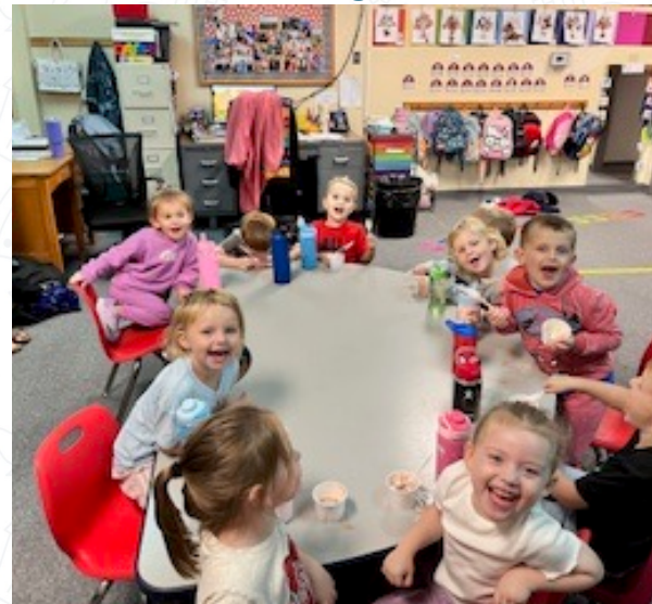
Ice Cream with half day PreK