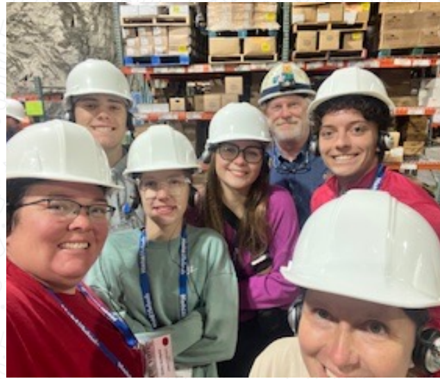
Inside the actual freezer storage area