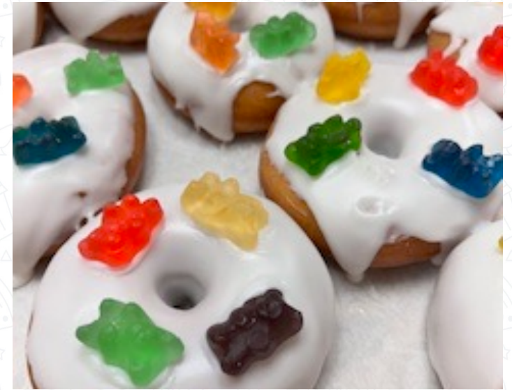
Donuts for OPAA Breakfast week