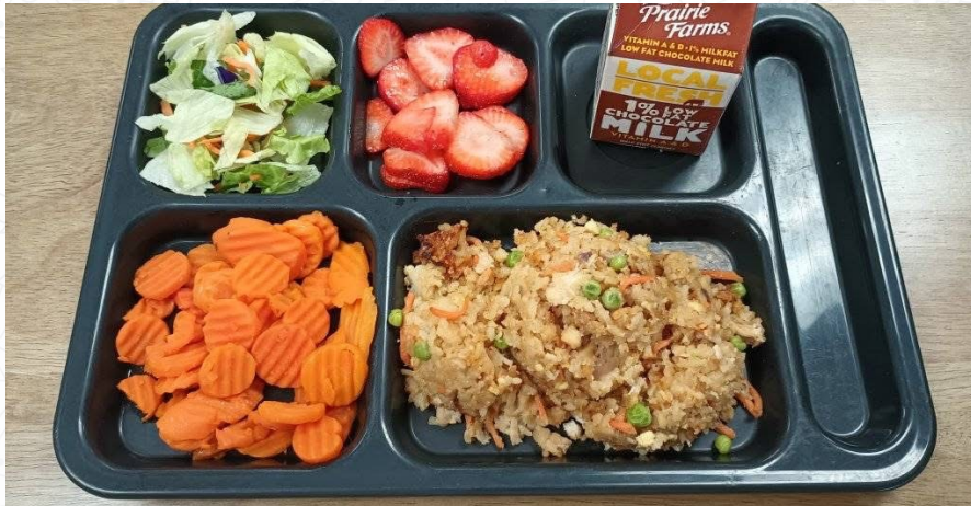
Chicken Fried Rice