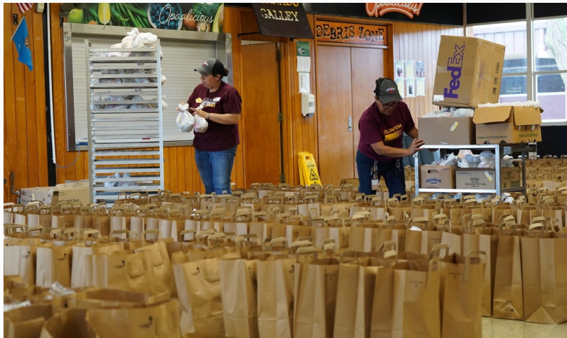
Prepping Take Home Meals