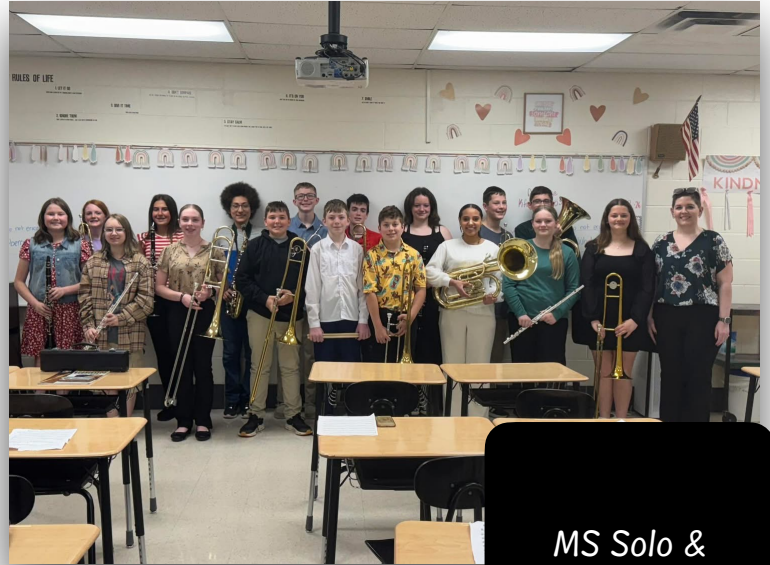
MS Solo & Ensemble