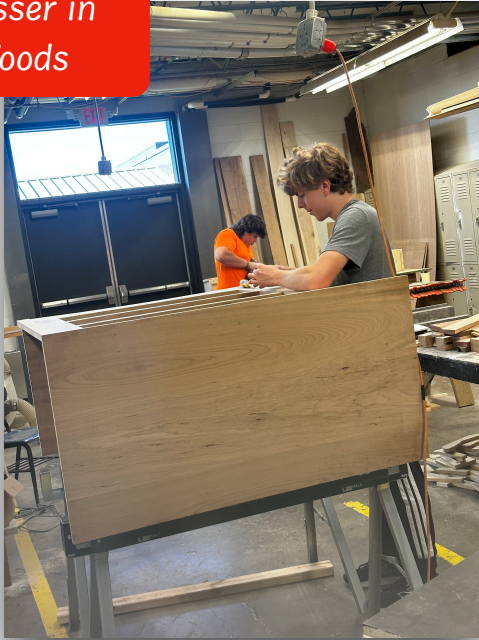
Making a dresser in Woods