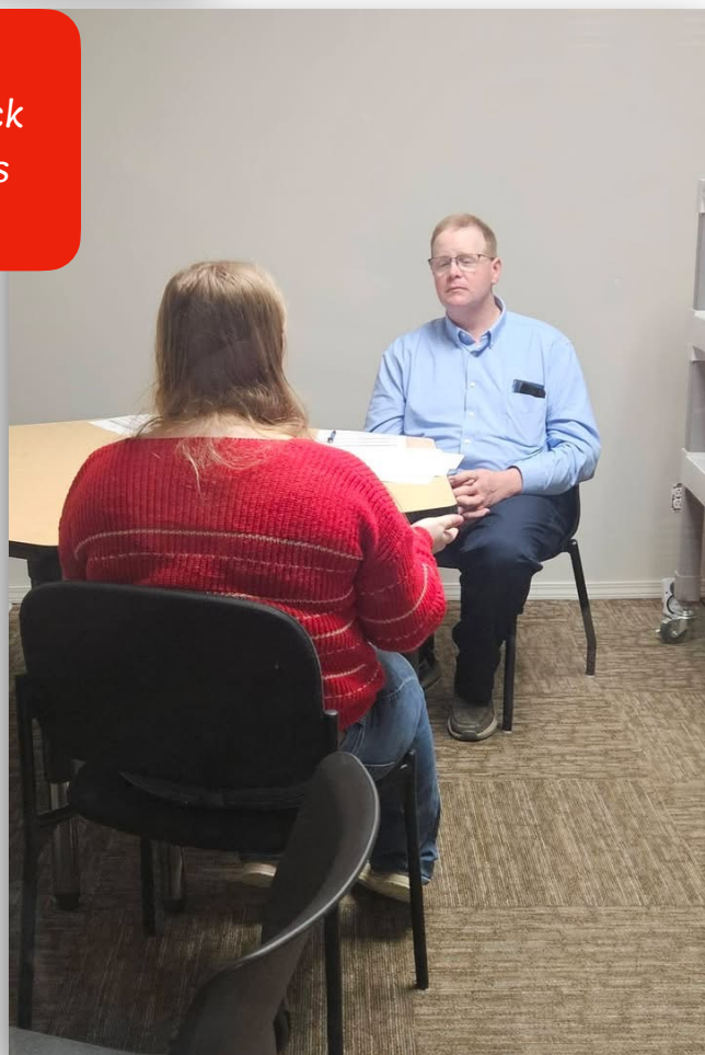
Senior Mock Interviews